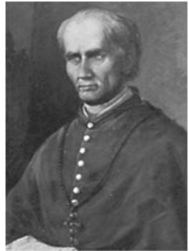
Joseph Sadoc Alemany, OP

California, having recently passed from Mexican to American rule and still containing a large Spanish population with Spanish customs and traditions, the appointment of Archbishop Alemany as the first bishop under the changed conditions was a providential measure. Ten years of missionary activity in Ohio, Kentucky, and Tennessee had enabled him to master the English language, which he spoke and wrote correctly and fluently. This familiarized Bishop Alemany with the customs and spirit of the Republic and imbued him with a love for the United States, which he carried with him to the grave.