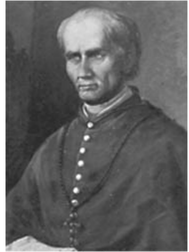
Joseph Sadoc Alemany, OP

California, having recently passed from Mexican to American rule and still containing a large Spanish population with Spanish customs and traditions, the appointment of Archbishop Alemany as the first bishop under the changed conditions was a providential measure. Ten years of missionary activity in Ohio, Kentucky, and Tennessee had enabled him to master the English language, which he spoke and wrote correctly and fluently. This familiarized Bishop Alemany with the customs and spirit of the Republic and imbued him with a love for the United States, which he carried with him to the grave.